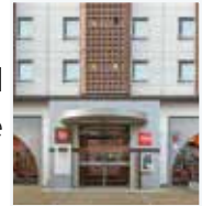
Ibis Eiffel Paris, France