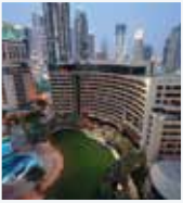
Le Royal Meridien Beach Resort Hotel Dubai, UAE