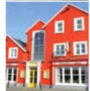
Dingle Bay Hotel Dingle, Ireland