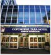
Copthorne Tara London, England