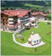
Hotel Das Urbisgut Altenmarkt im Pongau, Austria