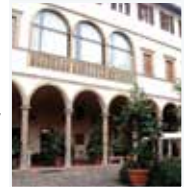
Hotel Palazzo Ricasoli Venice, Italy