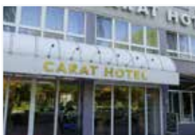
Carat Hotel Munich, Germany