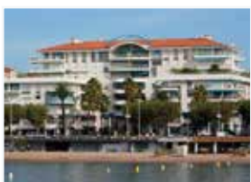
Hotel Continental Saint-Raphael, France