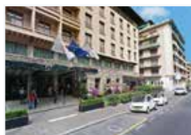
Grand Hotel Mediterraneo Florence, Italy