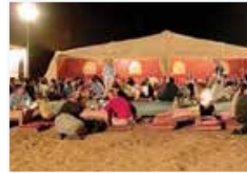
Overnight Desert Camp Dubai