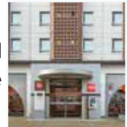
Ibis Eiffel Paris, France