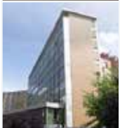
Hotel Regent Rome, Italy