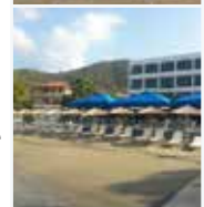
Hotel Pavlou Poros, Greece