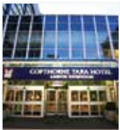
Copthorne Tara London, England